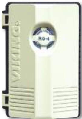
1 Line Wall Mounted Unit