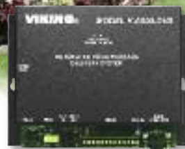
K-6000-DVA Automated Voice Message Delivery