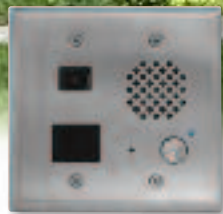
E-75-SS Entry Phone with Card Reader & Color CCTV Camera