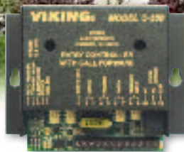
C-250 Controller with Call Forwarding