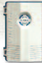
K-1900-30 Smart Touch Tone Dialer with Redialing