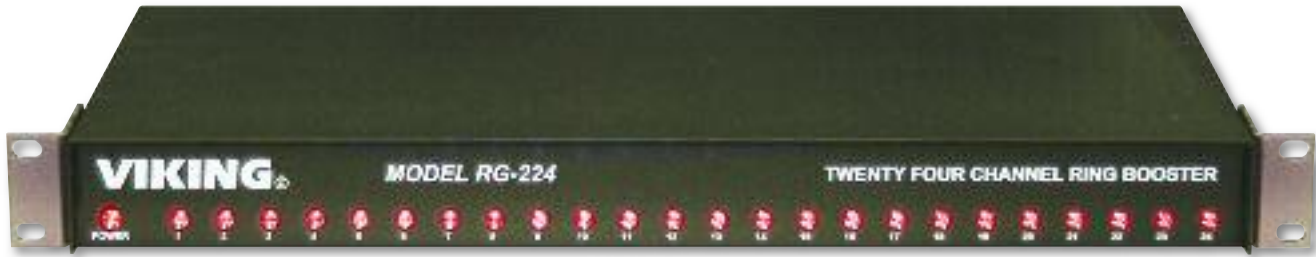
24 Line 19" Rack Mounted Ring Shaper/Booster