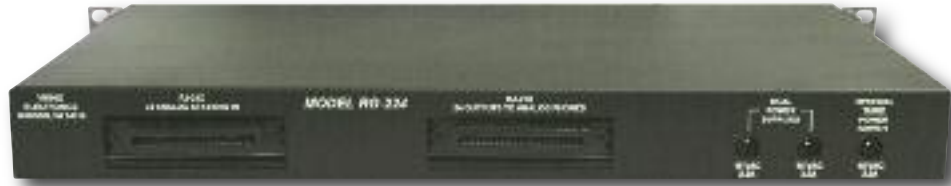
RG-224 Rear View