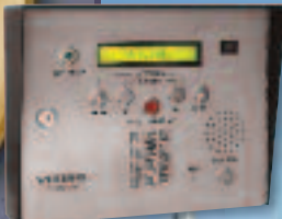
AES-2005S (Surface Mount)