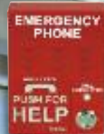
E-1600A ADA Emergency Phone