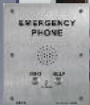
E-1600A-TP-EWP Handsfree Emergency ADA Phone