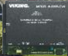
K-6000-DVA Automated Voice Message Delivery