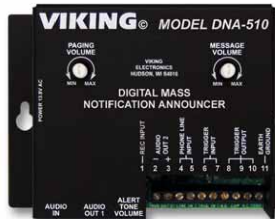
Model DNA-510 DOD# 492

The DNA-510 is a digital mass notification announcer, capable of providing up to 2 minutes of digitally recorded voice emergency instructions and alert tones over your existing paging system. The DNA-510 connects to a phone line, analog phone system station or a phone system's unused trunk/line input allowing you to securely page, trigger emergency messages and/or alert tones and program the unit from any remote touch tone phone. When activated, the DNA-510 will interrupt any current paging or background music and inject an emergency voice message and/or alert tone over your paging system. A live page can also be announced.