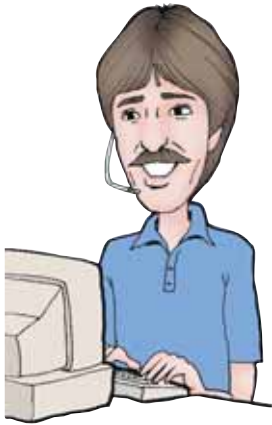
Model K-6000-DVA DOD# 307