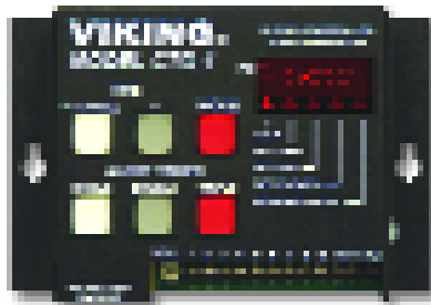
Model CTG-1 DOD# 460

The CTG-1 can be programmed to output single, double or triple alert tones with up to 128 events in a 24 hour period. These bong/buzzer sounds are ideal for indicating the start and end of shifts, break times, lunch periods, etc. for factories, schools, or any business requiring an audible indication of specified times. Each day of the week can be programmed to either on or off, allowing you to turn off the alert tones during specific days of the week (weekends, etc.)