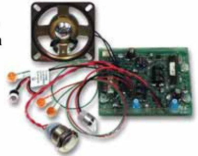
Model E-1600-50A DOD# 215

Both are ideal for installing behind elevator panels, or an installation requiring a custom panel. For outdoor or harsh environments, these phones are available with Enhanced Weather Protection (EWP).