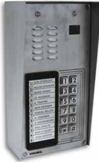
Model K-1205 DOD# 183

The K-1205 Entry Phone is a two-way, handsfree telephone with 12 buttons for calling individual residences in an apartment building. It also has a built-in color CCTV video camera. The rugged stainless steel faceplate has a printed directory housed in a waterproof, scratch-resistant lens. Each button is beside the tenants name in the directory so there are no confusing codes to deal with. Calling a particular tenant is as easy as pressing a single button. The K-1205 has a built in speed dialer that can handle up to 12 primary phone numbers, each with 22 digits. If there is no answer at the first number, a second number can be called automatically. Once the tenant answers their phone, a single touch tone command can activate the door strike relay. For outdoor applications, the K-1205 is available with Enhanced Weather Protection.