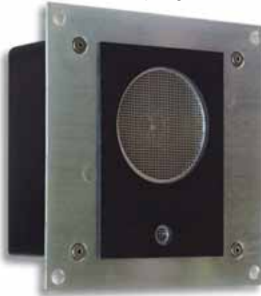
Model E-1600-55A DOD# 215

to 5 programmable emergency numbers, as well as 2 central station numbers. The E-1600-50A is a non-chassis parts kit and the E-1600-55A is a universal emergency phone kit.