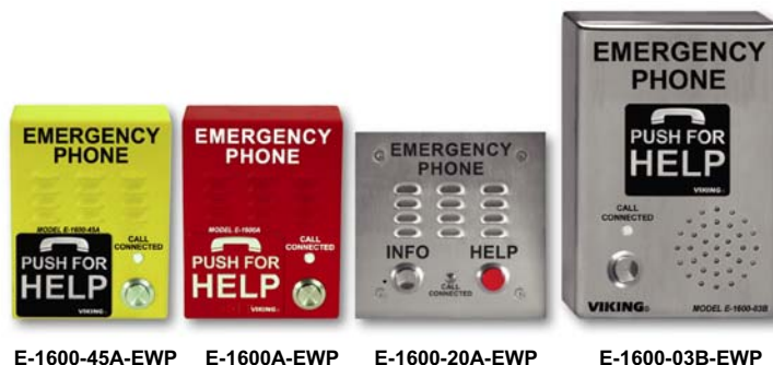
E-1600-45A-EWP E-1600A-EWP E-1600-20A-EWP E-1600-03B-EWP

Phone... 715.386.8861 http://www.vikingelectronics.com