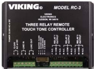
Model RC-3 (DOD# 160)

The K-2000-DVA Digital Announcer is designed to be fully compatible with the Viking models RC-2A and RC-3 remote DTMF controllers. No conflicts between the devices will occur, provided that both units are accessed using the operation and programming guidelines described below.