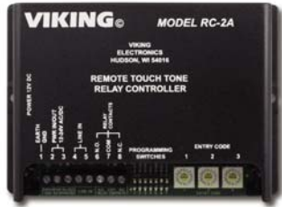
Model RC-2A (DOD# 165)