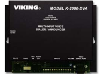
Model K-2000-DVA (DOD# 303)

The K-2000-DVA Digital Announcer is designed to be fully compatible with the Viking models RC-2A and RC-3 remote DTMF controllers. No conflicts between the devices will occur, provided that both units are accessed using the operation and programming guidelines described below.