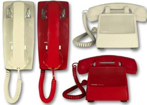
K-1500P-W Ash / Red