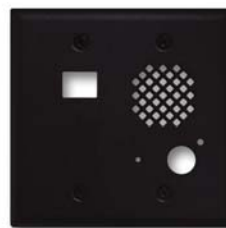
PNL65-BK (Fine Texture Satin Black)

The PNL65 is a replacement faceplate with color matching screws and LED light pipe for the E-65 Series entry phones.