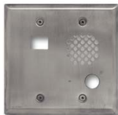
PNL65-SS (Brushed Stainless Steel)

Update Your E-65 Series Phone to a Unique Faceplate Finish or Replace an Existing Damaged Faceplate