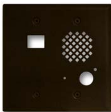
PNL65-BN (Oil Rubbed Bronze)