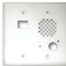
PNL65-WH (Satin White)