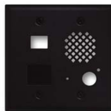
PNL75-BK (Fine Texture Satin Black)

The PNL75 is a replacement faceplate with color matching screws and LED light pipe for the E-75 Series entry phones.