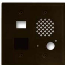
PNL75-BN (Oil Rubbed Bronze)