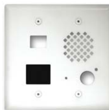
PNL75-WH (Satin White)