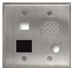
PNL75-SS (Brushed Stainless Steel)

Update Your E-75 Series Phone to a Unique Faceplate Finish or Replace an Existing Damaged Faceplate