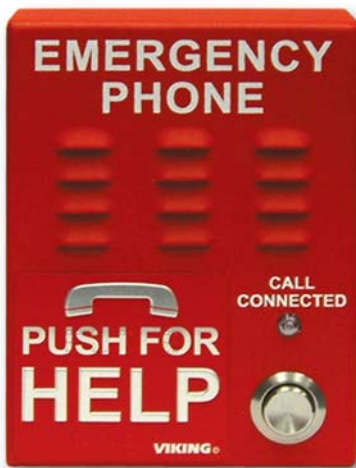
Model E-1600A (analog) or E-1600-IP (VoIP)

The E-1600A and E-1600-IP are compact Emergency Phones designed to provide quick and reliable communication. These bright red handsfree phones meet ADA requirements for elevator/emergency telephones.