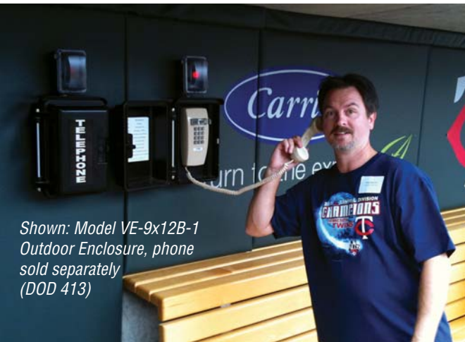
Shown: Model VE-9x12B-1 Outdoor Enclosure, phone sold separately (DOD 413)

It takes numerous people to coordinate a professional sports team - especially during a game. Usually there are coaches on the field, in the dugout, in the bullpen, as well as many other personnel working behind the scenes.