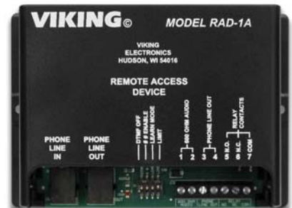
For more information on the RAD-1A, search DOD 410 or call: 715-386-8861

The RAD-1A answers on the first ring and disconnects on CPC, call time out, silence time out, busy, or by dialing #7. Separate 600 Ohm audio and telephone line outputs are provided, allowing connection to audio amplifiers, digital announcers, or phone systems.