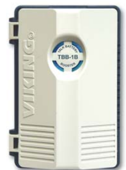
For more information on the TBB-1B, search DOD 632 or call: 715-386-8861