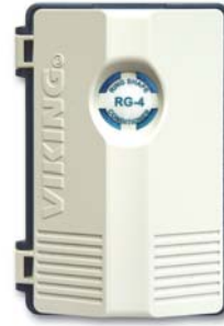
RG-4 (DOD 416)