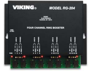
RG-204 (DOD 417)