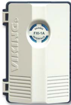
For more info on the FXI-1A, search DOD 483 or call: 715-386-8861

The RAD-1A remote access device gives authorized users remote access to one way paging amplifiers, digital announcers, and other audio programs. A programmable access code prohibits access by unauthorized users.