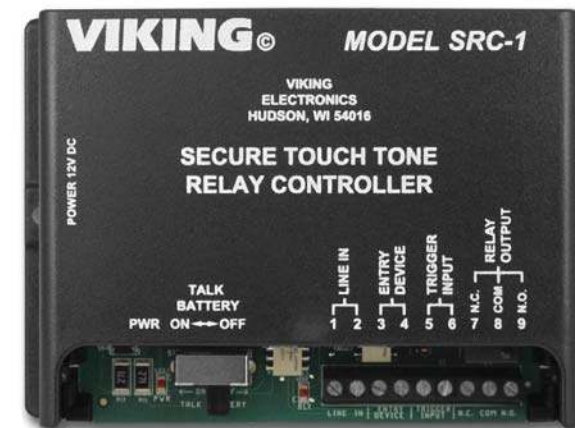
For more information on model SRC-1, see DOD 176.

The SRC-1 also provides up to 32 keyless entry codes to operate the relay from the entry phone with 1 to 6 digits. This feature can be disabled in programming for increased security.