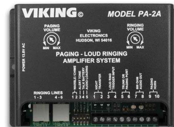
For more information on model PA-2A, see DOD 485.