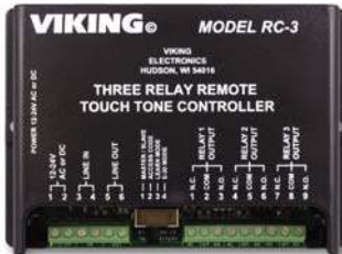
Model RC-3 (DOD# 160)

The K-202-DVA digital announcer is designed to be fully compatible with the Viking models RC-2A and RC-3 remote DTMF controllers. No conflicts between the devices will occur, provided that both units are accessed using the operation and programming guidelines described below.