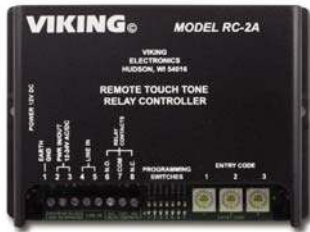
Model RC-2A (DOD# 165)