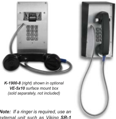
K-1900-8 (right) shown in optional VE-5x10 surface mount box (sold separately, not included)

The K-1900-8-EWP shares all of the features of the K-1900-8 in addition to Enhanced Weather Protection (EWP) for outdoor installations where the unit is exposed to precipitation or condensation. EWP products feature foam rubber gaskets, sealed connections, gel-filled butt connectors, as well as urethane or thermal plastic potted circuit boards with internally sealed, field-adjustable trim pots and DIP switches for easy on-site programming. For more information, see DOD 859 .