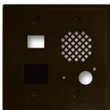
PNL75-BN (Oil Rubbed Bronze)