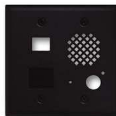
PNL75-BK (Fine Texture Satin Black)

The PNL75 is a replacement faceplate with color matching screws and LED light pipe for the E-75 Series entry phones.